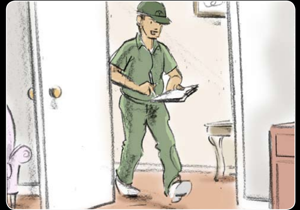
DELIVERY MAN: I forgot to get y...