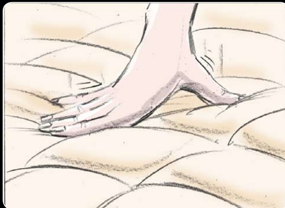
Feel that comfort.