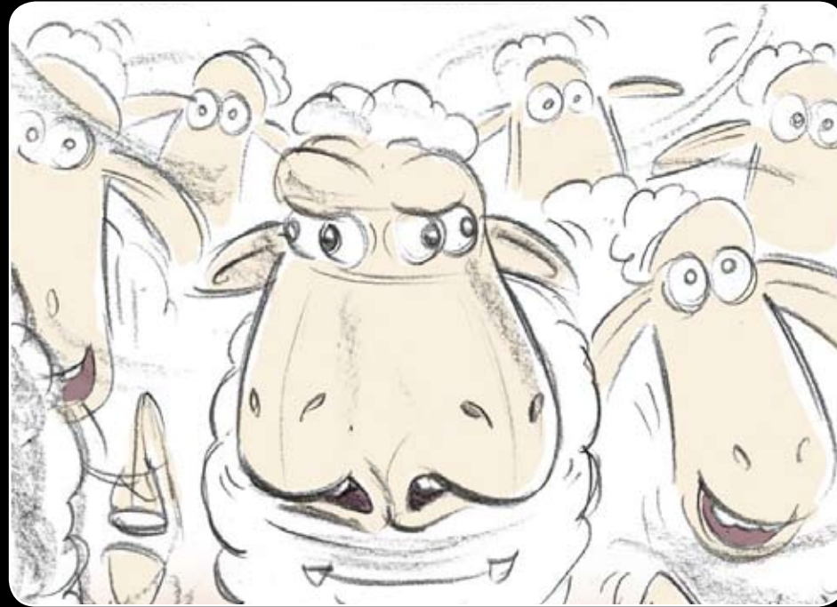
This is unprofessional.