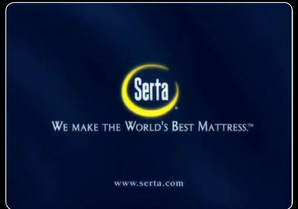
VO: Serta. We make the world's best mattress.