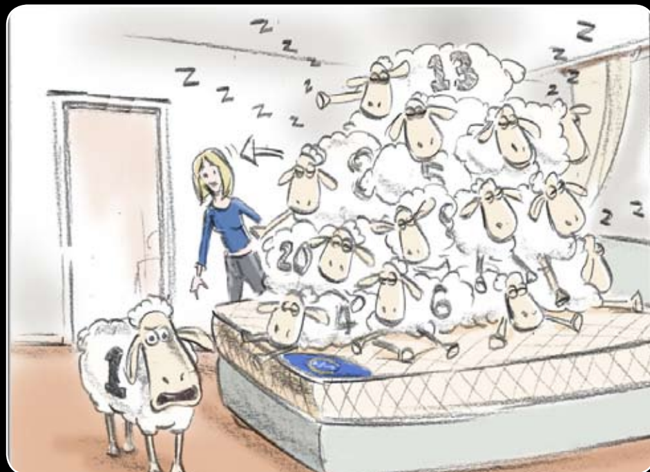
ONE: Happy now, mattress man.