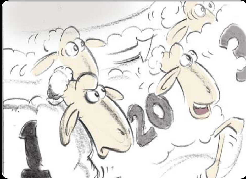
ONE: Hey guys, hey hold it. Stop. SHEEP: Looks good. Coming through. Quit pushing.